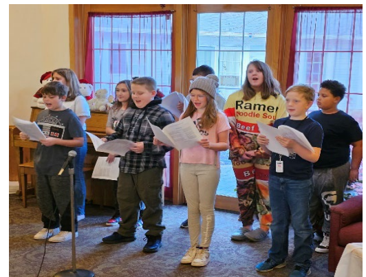
Jean McNair Elementary 5 th Choir December 2023