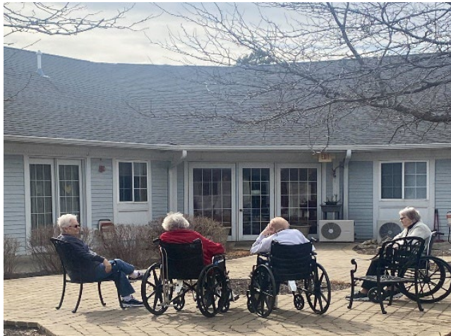
Enjoying the early Spring Weather - Leap Day 2024