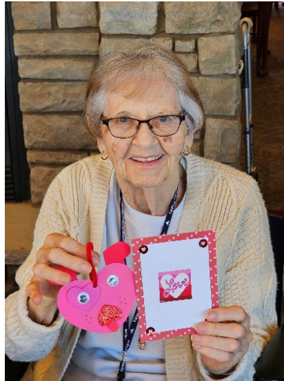
Valentines 2024 Crafting Fun