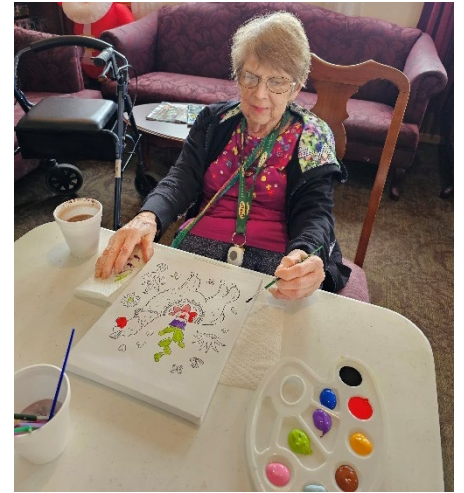
Paint & Sip-January 2024