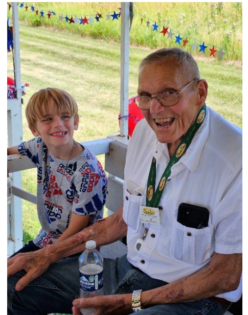
July 4 th Parade 2023