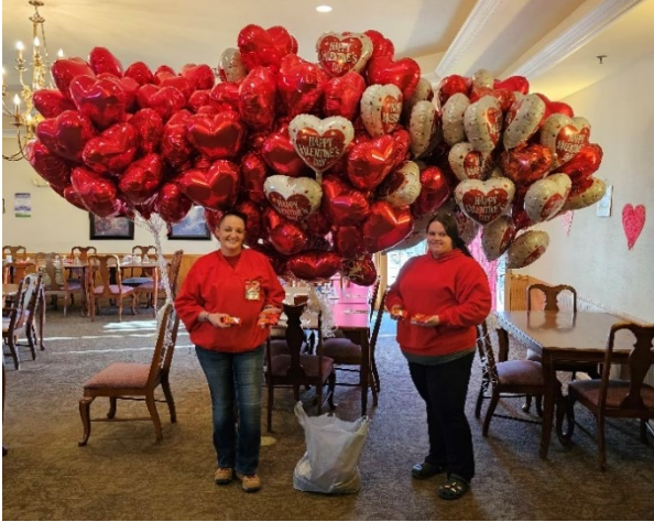
Valentine's Day 2024

Oh, The Fun We've Had..... We Love Our Small-Town & they Love us right back!